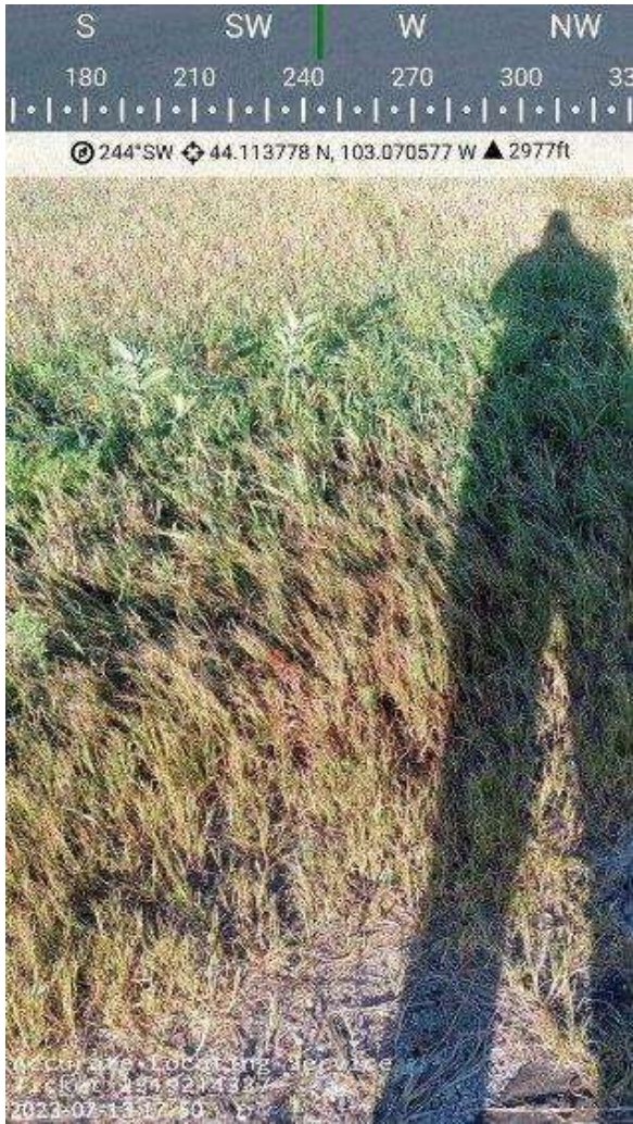
Dana Fetch uploaded attachment Fri, 18 Aug 2023 01:49:01 AM