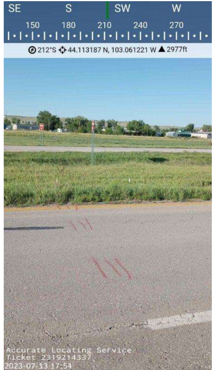
Dana Fetch uploaded attachment Fri, 18 Aug 2023 01:48:53 AM