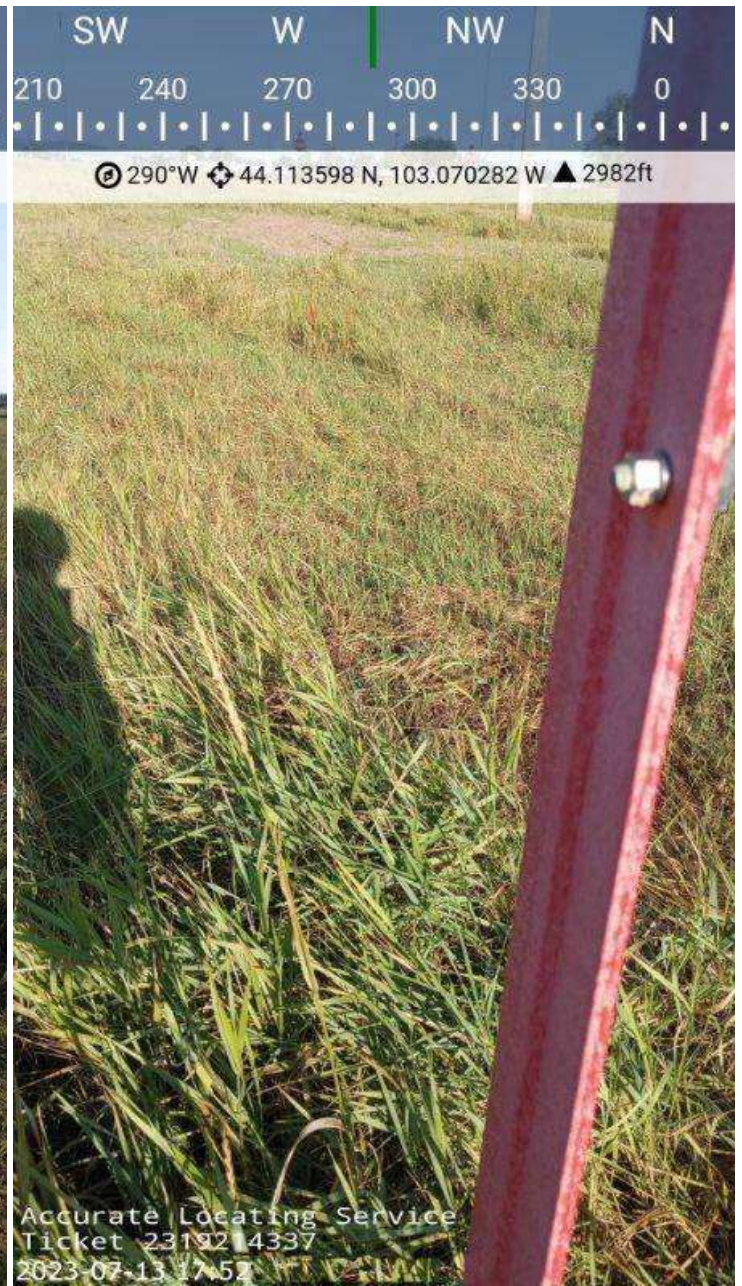
Dana Fetch uploaded attachment Sun, 20 Aug 2023 04:45:22 AM