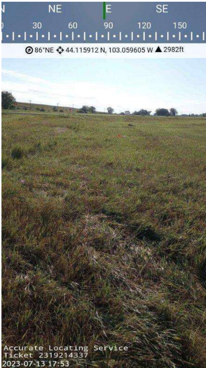
Dana Fetch uploaded attachment Sun, 20 Aug 2023 04:45:32 AM